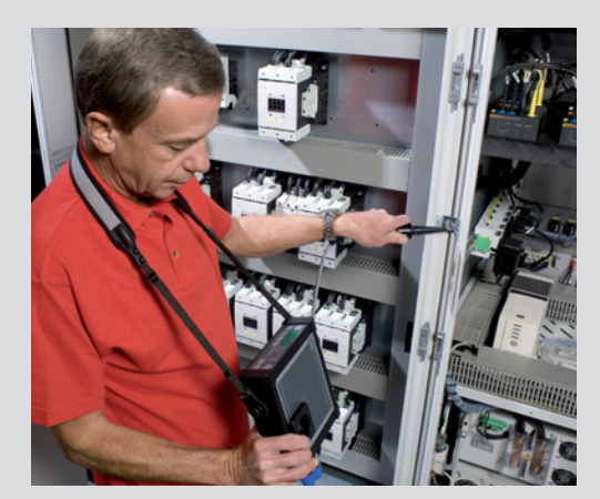
EN60204 test at a service cabinet